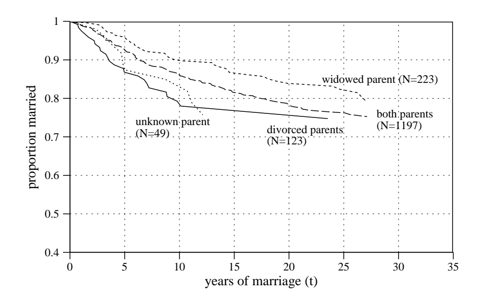
Figure 3: Proportion of still-married couples by marriage duration for four different types of family background in East Germany (Kaplan-Meier estimates)

Log-Rank (Savage) = 0.174; Wilcoxon (Breslow) = 0.052