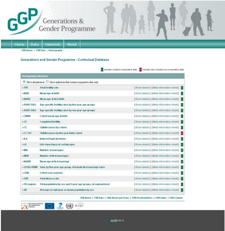
Figure 1: Choice of indicators about demography.

extracting data according to the users' needs. Green or respective red flags signal whether an indicator contains solely cross-country comparative data or also non-comparative data. The latter are, however, the exception in the CDB. For those cases, where the provided data deviates for some countries or regions from the variable definition, this is documented in the meta-information. While the database also offers to immediately download all data available for an indicator, there is also the possibility to restrict the output based on certain selection criteria such as for specific years and geographical unites. Depending on the indicators, other selection features may be available (e.g., age and sex). In addition, users can choose the dimensions of the output (e.g., to organise the data columns by regions, by time, etc.). Data can be exported in different formats (e.g., CSV, XLS, and XML).