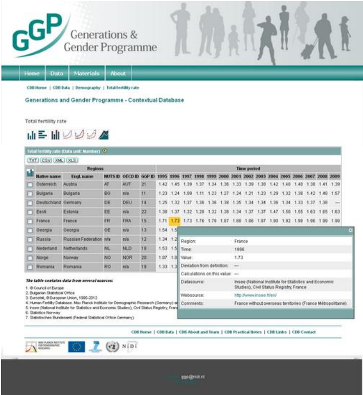
Figure 2: Data output (with metadata for a single data entry and GGP geo-codes)

Furthermore, the CDB allows users to include an identity (ID) column in the output that provides the geocode used in the GGS survey to identify the place of residence of an interviewed person (see figure 2). With this code, the user should find it easy to match the extracted CDB data with the GGS data. In addition to the GGS codes, other regional coding schemes, such as NUTS and OECD, are also supported, which allows researchers to match the CDB data with data from other surveys (e.g., the European Social Survey).